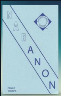
Nar-Anon Blue Booklet First published in July 1967